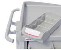
110% total opening shelf